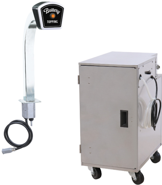
Model without photo-eye shown above. Countertop to be provided by customer.